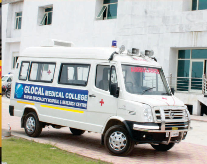
24x7 Ambulance Facility