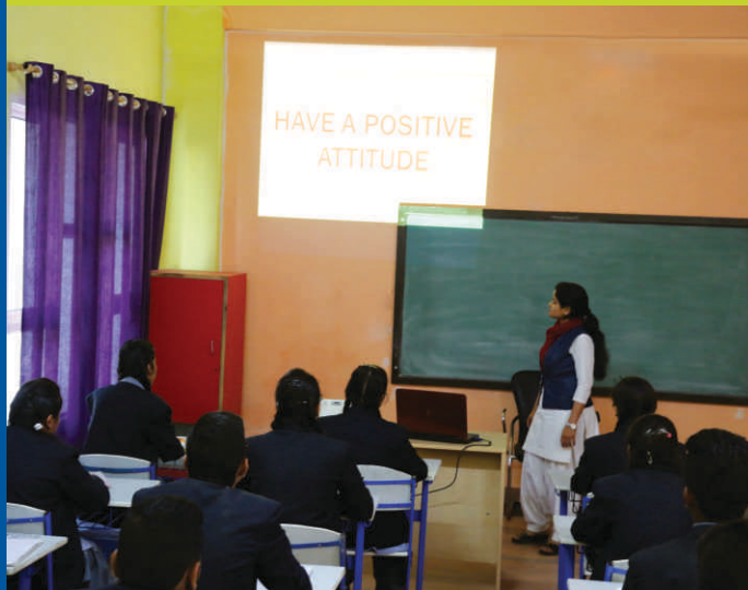
Personality Development Programme