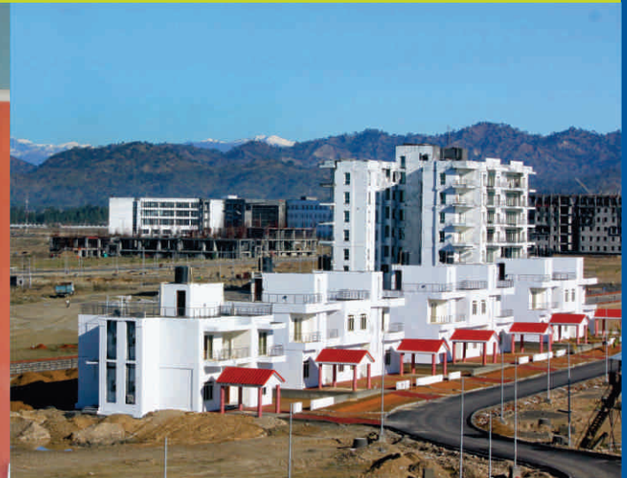
Residences and Leisure Facilities for Faculty