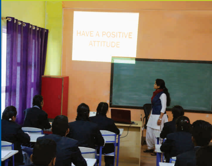
Personality Development Programme