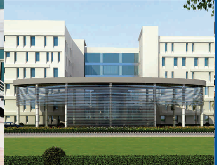
Multi Speciality Hospital