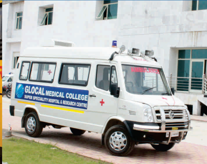
24x7 Ambulance Facility